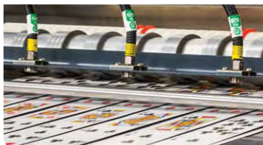
Gen4 Ionizing Points remove static from a card slitting operation.