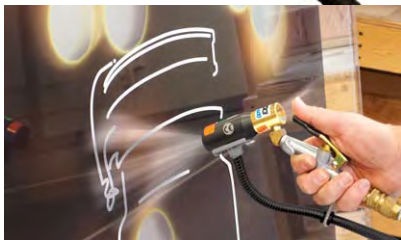
The Model 8293 Gen4 Ion Air Gun cleaning artwork and glass prior to framing.

The Gen4 Ion Air Gun is quiet, lightweight and features a hanger hook for easy storage. The 10 foot (3m) armored and electromagnetic shielded power cable is extremely flexible, designed for rugged industrial use.