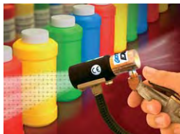
The Model 8293 Gen4 Ion Air Gun neutralizes and cleans plastic bottles prior to labeling.