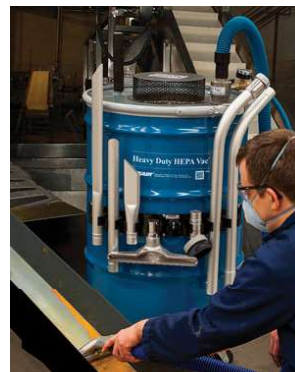
A technician uses a Heavy Duty HEPA Vac to perform scheduled maintenance on a pulverizer.