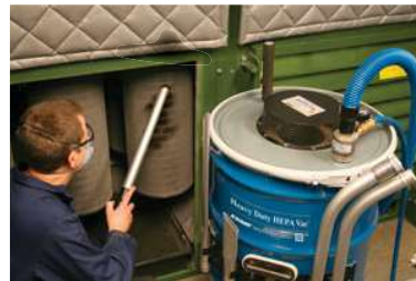
A clogged filtering system for a buffing booth is quickly cleaned and put back into service using the Heavy Duty HEPA Vac.