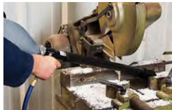
Model 6392 Vac-u-Gun All Purpose System removes plastic shavings from a saw.