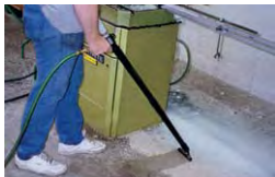
Model 6192 Vac-u-Gun Collection System with bag vacuums absorbent and chips.