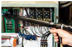
Model 6292 Vac-u-Gun Transfer System carries dust away from sensitive electronic controls.