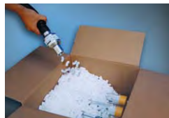
A Model 130125 1-1/4" (32mm) Light Duty Line Vac can fill or empty the packing peanuts from shipping cartons.