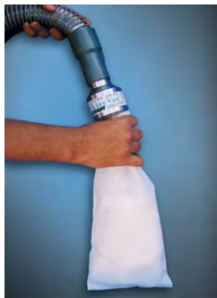
The low cost Model 130200 2" (51mm) Light Duty Line Vac conveys fibers to fill pillows, stuffed animals, diapers, etc.