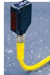
Photoelectric sensor withstands water and dust.