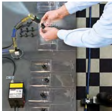
The Gen4 Model 8910 Instant Static Elimination Station removes contaminants on plastic fittings prior to packaging.