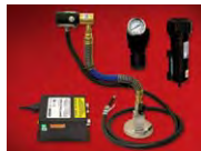
Model 8494-9362 Gen4 Stay Set Ion Air Jet Kit includes the Gen4 Stay Set Ion Air Jet, Model 7960 Gen4 Power Supply, filter separator and pressure regulator (with coupler).