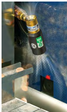
The Model 8294 Gen4 Ion Air Jet with Gen4 Power Supply neutralizes static and removes dust from a counting sensor window on a tablet production machine.

The Gen4 Stay Set Ion Air Jet comes complete with a magnetic base that allows easy mounting and portability on a machine, a bench or other surface. A shutoff valve on the base provides infinite control of the force and flow. For hands free operation, an optional Model 9040 Foot Pedal (requires floor or machine mounting) is available.