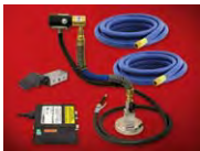
Model 8910 Gen4 Instant Static Elimination Station includes the Gen4 Stay Set Ion Air Jet, Model 7960 Gen4 Power Supply, foot pedal and (2) 10' (3m) hoses.