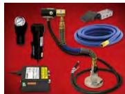
Model 8495-9362 Gen4 Deluxe Stay Set Ion Air Jet Kit includes the Gen4 Stay Set Ion Air Jet, Model 7960 Gen4 Power Supply, filter separator and pressure regulator (with coupler), foot pedal and 10' (3m) hose.