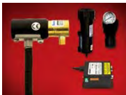
Model 8494 Gen4 Ion Air Jet Kit includes the Gen4 Ion Air Jet, Model 7960 Gen4 Power Supply, filter separator and pressure regulator (with coupler).

1/4" NPT inlet provided on Gen4 Stay Set Ion Air Jet.