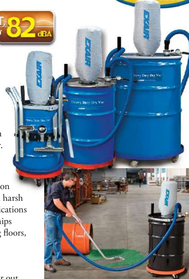
The Heavy Duty Dry Vac cleans up a spill of tumbling media.

Electrically operated vacuums have motors and impellers that clog and wear out quickly. There's also a potential shock hazard when electric vacs are used in standing liquids. The Heavy Duty Dry Vac is compressed air powered which eliminates the shock hazard. It has no moving parts to wear out or break, to assure long life. It is quiet with a sound level that is half that of electric vacs. A static resistant hose prevents painful shocks when vacuuming dry materials.