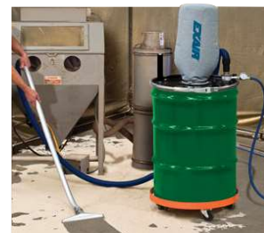
Sand that covers the floor around a sand blaster is quickly vacuumed into the drum using the rugged floor tool.