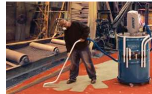
110 Gallon Heavy Duty Dry Vac provides maximum capacity cleanup for a large, dusty walnut shell blasting application.